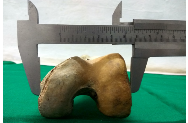
Fig. 1: Measurement of Bicondylar width using Vernier calliper

Bicondylar width (BCW): Total length in transverse plane between medial and lateral epicondyles. (Figure 1)