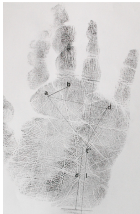
Fig. 3: Non significant type c line in case of diabetic patient.