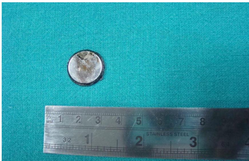
Fig. 1: Removed Button battery