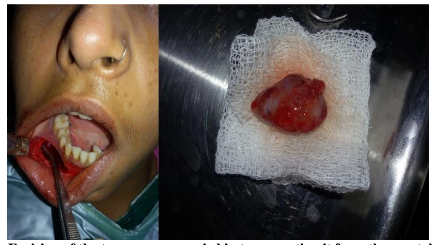
Fig. 3: Excision of the tumour was carried in to separating it from the mental nerve