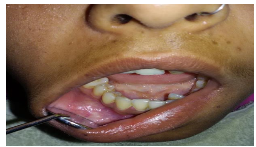
Fig. 1: Intraoral examination not associated with any discharge or change the texture of the overlying tissue