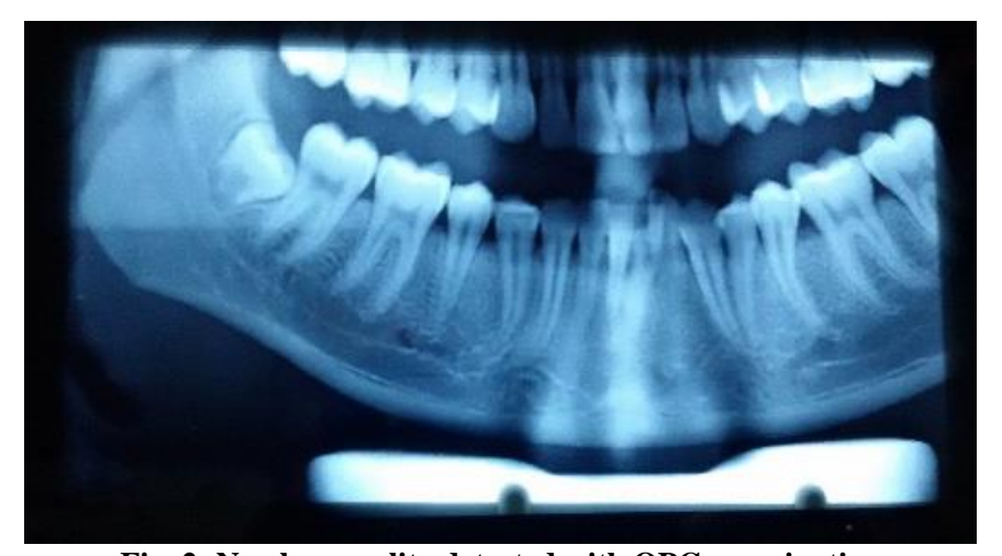
Fig. 2: No abnormality detected with OPG examination