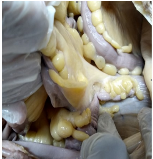
Fig. 4: Showing promonteric appendix