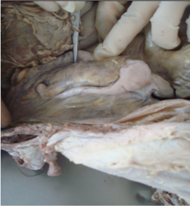
Fig. 5: Showing paracolic appendix