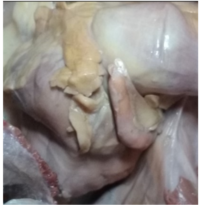
Fig. 3: Showing postileal appendix