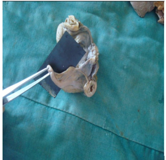
Fig. 7: Showing mesoappendix not reaching the tip