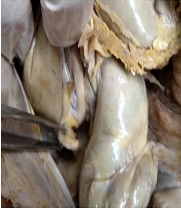
Fig. 1: Showing retrocaecal appendix