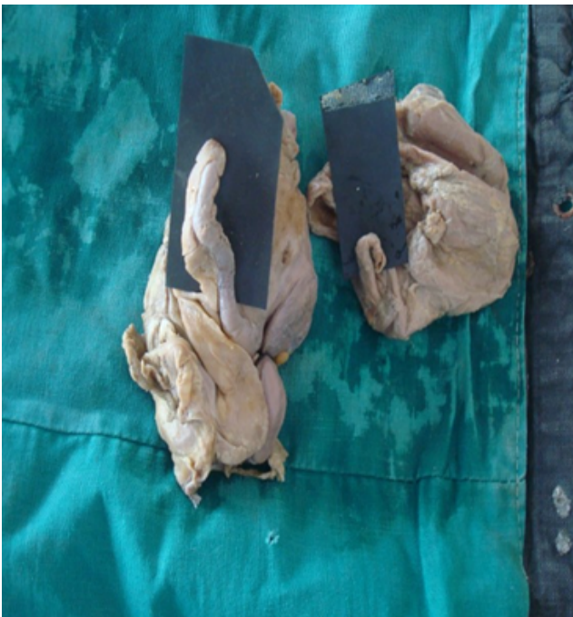
Fig. 6: Mesoappendix reaching the tip