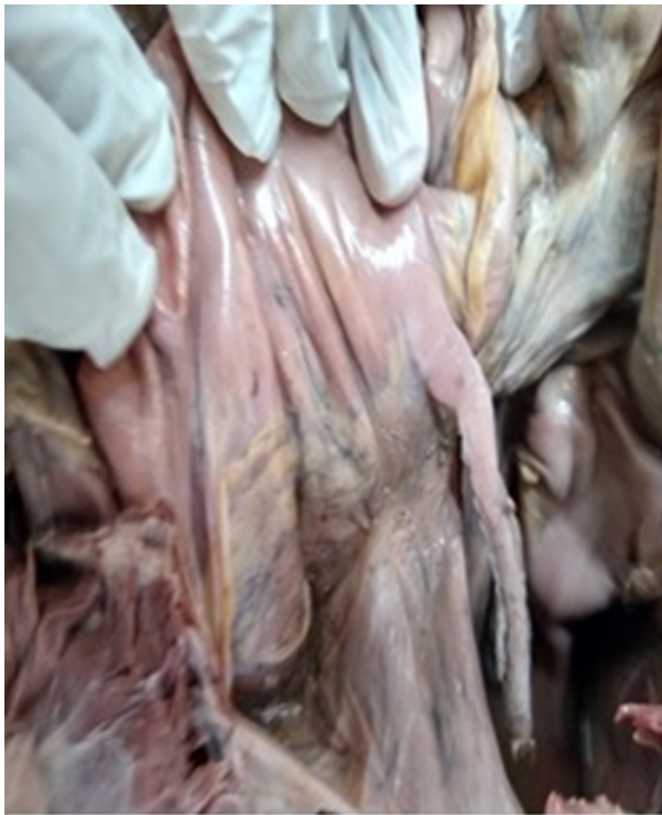
Fig. 2: Showing pelvic appendix