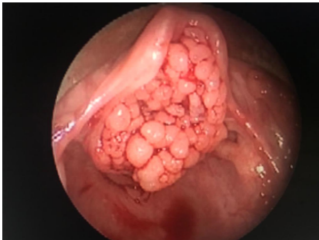
Fig. 2: Extensive papillomatosis lesion causing complete obstruction of airway

underwent tracheostomy due to excessive respiratory distress in 2019 during which the symptoms increased and the lesions became more extensive (Figure 2) and obvious at the level of trachea and carina.