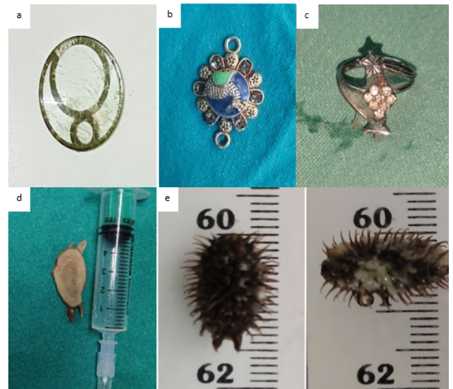
Figure 4: Showing foreign body- a: Showing plastic ring; b: Showing metallic foreign body Rakhi; c: Showing metallic foreign body Ring; d: Showing turtle bone; e: Showing castor seed