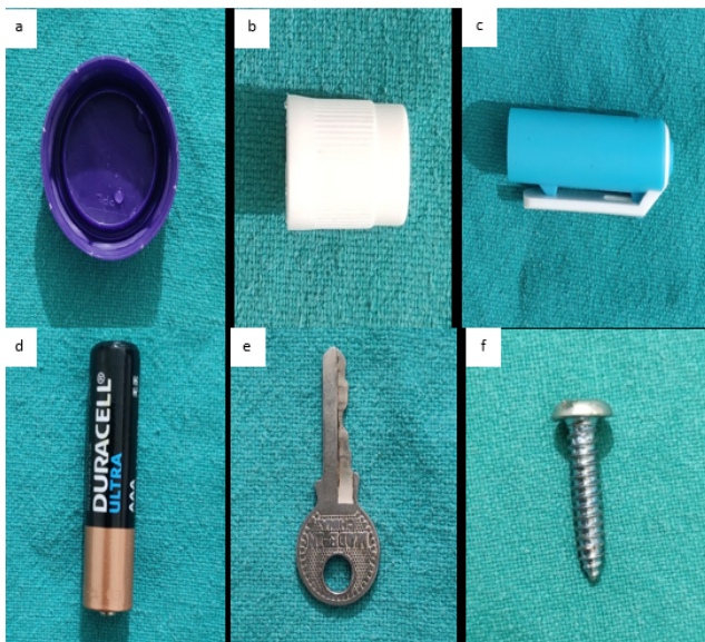
Figure 3: Showing foreign body- a, b: Showing plastic bottle cap; c: Showing plastic pen cap; d: Showing battery; e: Showing metallic key; f: Showing metallic nut

performed in all cases when indicated, X-ray abdomen and CT scan of required portion is performed as required.