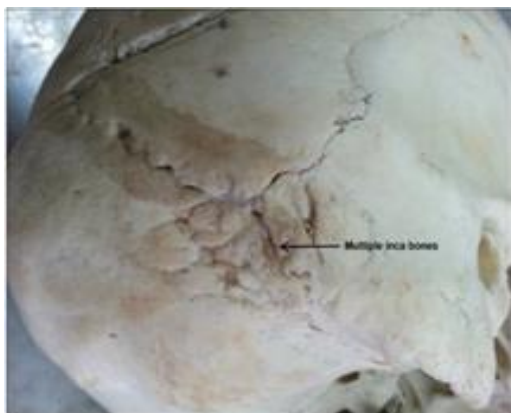
Fig. 4: Arrow showing the wormian bone at Asterion.