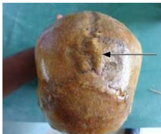
Fig. 2: Arrow showing the wormian bone at Lambda.