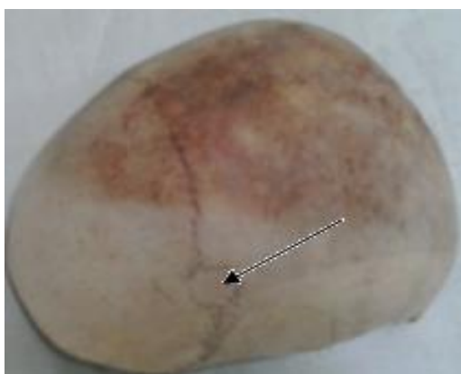
Fig. 5: Arrow showing the Wormian bone at the coronal suture.