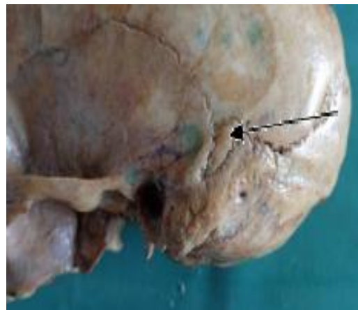
Fig. 1: Arrow Showing the wormian bone at asterion.