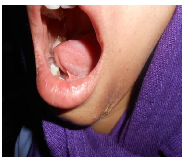
Fig. 2: Intra oral lesion