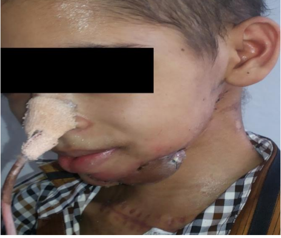
Fig. 9: Post-operative patient after detachment of pedicle of PMMC flap