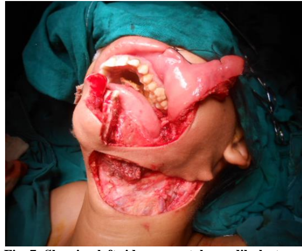
Fig. 7: Showing left side segmental mandibulectomy