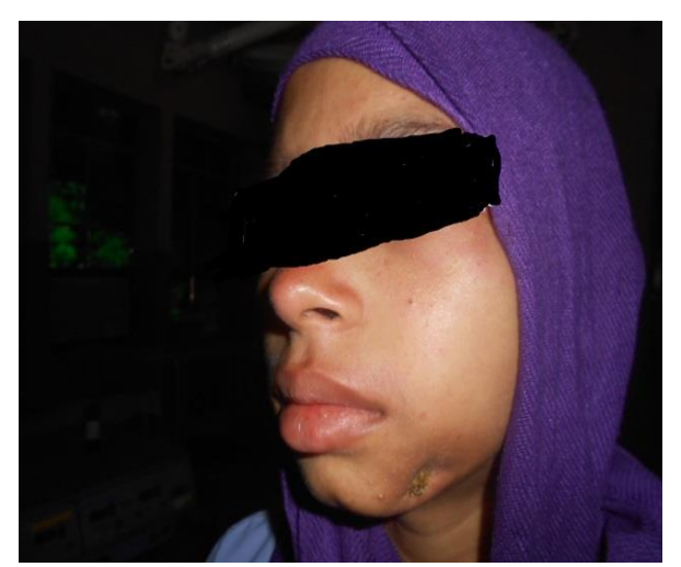
Fig. 1: Extra oral lesion