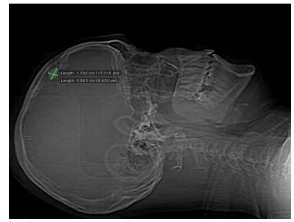
Fig. 2: Lateral scout view on computed tomography shows a radio-opaque structure measuring approximately 13 x 8.6mm under the depressed fracture of frontal bone