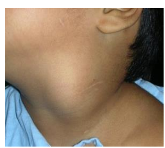
Fig. 1: Girl with Left Side Neck Mass (Cervical sympathetic chain schwannoma)

defined mass of 3.5 x 3.5 x 5.3 cm size on the left side of neck in paravertebral region. The carotid vessels were seen abutting the mass on its medial aspect with internal jugular vein on the lateral side but could not reveal a definitive diagnosis. The patient was planned for excision under general anaesthesia. Before taking up the patient for surgery, he was explained about the of developing Horner's postoperatively. During surgery the mass was found abutting the common carotid artery and vagus nerve medially and internal jugular vein laterally. Hypoglossal nerve was identified superior to the mass. The tumor was found to be tapering in cervical sympathetic chain. It was 4x5 cm in size and removed in toto with its capsule intact. The specimen was sent for histopathology which showed fascicles of spindle cells having wavy nuclei in a fibrillary background and many scattered uni to multinuclear ganglion cells suggestive of schwannoma (Fig. 2). The patient developed all features of Horner's syndrome, miosis, ptosis, and anhidrosis, in the postoperative period. The patient was discharged on 5th post-op day. On 3 year follow up patient had no recurrence.