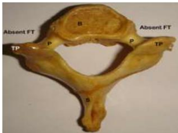
Fig. 4: Absent foramen transversarium bilaterally

Double Foramen Transversarium (FT) is reported by many authors. The incidence of double FT reported by the various authors varies from 1.5% to 23%. The Foramen Transversarium is a result of the special formation of the cervical transverse processes. It is formed by the vestigial costal element fused to the body and the true transverse process of the vertebra. The vertebral vessels and nervous plexus are caught between these two bony parts. The foramen transversarium is closed laterally by the costotransverse bar, and a thin plate of bone connecting the rib element to the original transverse process. Studies have been conducted earlier to study the variations of F.T in