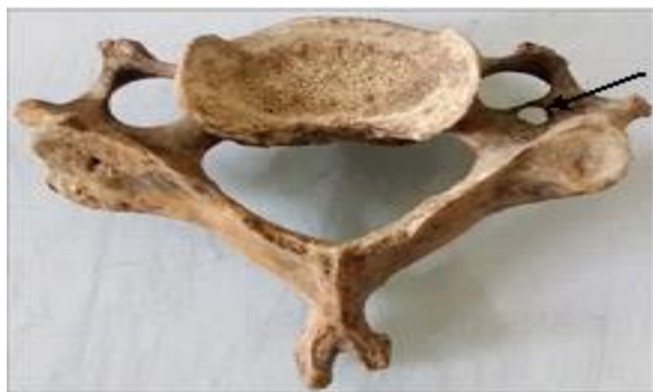
Fig. 2: Arrow pointing towards accessory Foramen Transversarium (unilaterally)