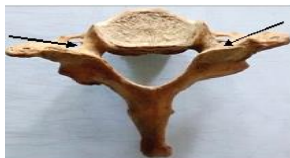
Fig. 1: Arrow pointing towards accessory foramen transversarium (bilaterally)