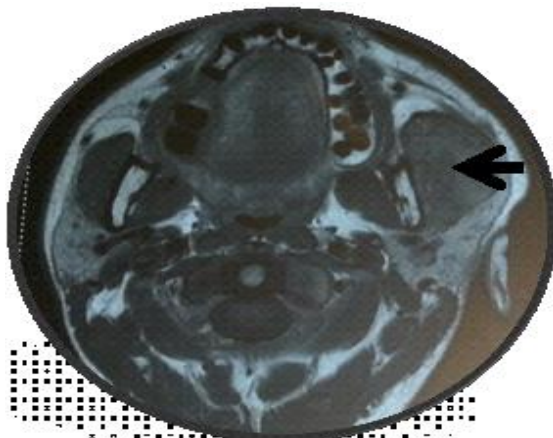
Fig. 3: MRI Showing muscle belly involvement and displacing adjacent parotid

On investigation his blood investigations were found to be within normal limits. Magnetic Resonance Imaging(MRI) scan was called for and showed an ill defined, altered signal intensity lesion involving the left masseter muscle and parotid gland. The swelling was iso-intense to hyper-intense on T1 and markedly hyper-intense on T2 with hetero-genous mild enhancement post contrast. The lesion was diffusely involving the muscle belly and causing bulkiness of the parotid gland [Fig. 3]. A very small component was noted to be extending into in the left parapharyngeal space. No major vascular feeders of the lesion were seen and the rest of the left masticator space was normal. The report was given as possible intra-masseteric or intra-parotid hemangioma.