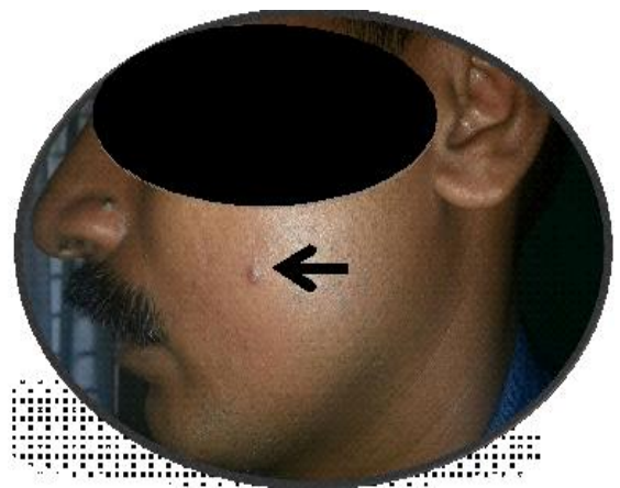
Fig. 1: Swelling over the left side of face and a fullness seen in the parotid region of left side

the swelling increased in size along with gross restriction of mobility [Fig. 2]. The swelling was not palpable intra orally. No local lymph nodes were palpable. No venous hum or bruit was audible on auscultation.