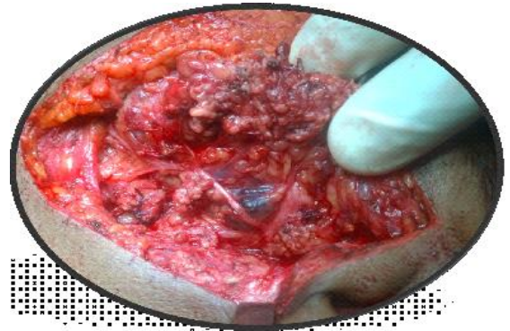
Fig. 4: Intra-operative picture showing dilated vessels suggestive of haemangioma

involved masseteric muscle tissue was carried out [Fig. 5]. Post-operative period was uneventful and the patient was discharged after 5 days with a clean wound. The histo-pathological examination confirmed the presence of hemangiomatous tissue within the muscle tissue [Fig. 6]. At 3 months of follow-up, patient was found to be doing well, with no major complaints.