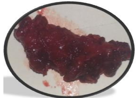
Fig. 5: Excised specimen showing parotid tissue along with haemangioma