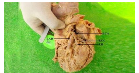
Fig. 2: Showing the specimen with trifurcation of LCA trunk