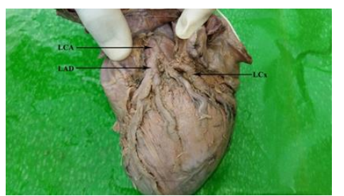
Fig. 1: Showing the specimen with bifurcation of LCA trunk

Out of 85 specimens studied in 49 (57.66 %) specimens the LMCA bifurcated into LAD and LCx (Fig. 1). In 32 (37.66 %) specimens the LMCA trunk trifurcated and the 3 branches were LAD, LCx and left diagonal artery (Fig. 2). In 3 (3.5 %) specimens it quadrifurcated with 2 left diagonal arteries between the LAD and LCx while in 1 (1.18 %) specimen it pentafurcated with 2 left diagonal arteries and one left marginal artery between the LAD and LCx (Table No 1). Three specimens showed quadrifurcation where in all the three specimens the four branches where the LAD, LCx and two diagonal arteries which supplied the left ventricle and ended before the apex (Fig. 3). The specimen where pentafurcation (Fig. 4) was seen had the termination of LMCA into LAD, LCx and two diagonal arteries which ended before apex and a left marginal artery which ran along the obtuse margin to the apex and ended before it.