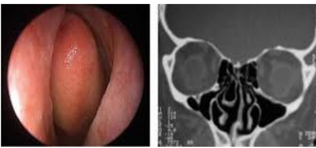
Fig. 1: Concha bullosa

CT is able to identify turbinate pneumatisation more accurately as compared to nasal endoscopy.