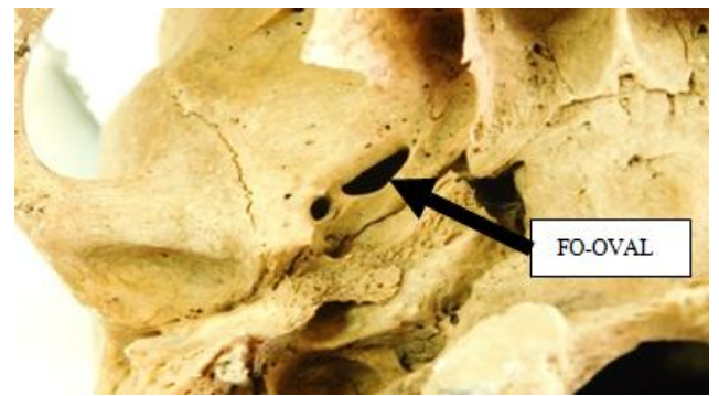
Fig. 1: FO- Oval shaped

We observed morphological variants of FO like round (9%) and oval (91%) on right side and on left side it was oval in 89% and round in 11% respectively (Table 4). FS was in round shape in 100%. In the present study, Emissary sphenoidal foramen were observed in 10 cases- 6 on right and 4 on left side of skulls (Table 3).