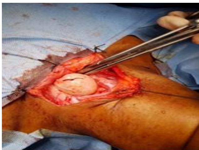
Fig. 1: Intra-Operatively showing cystic mass occupying the left supraclavicular region

Thoracic duct cysts diagnosed post-mortem, the first by Enzmann in 1883. 1,2 Tsuchiya et al (1980) reviewed eight cases described since 1950 and added one case which they believed to be the first diagnosed before thoracotomy. 2