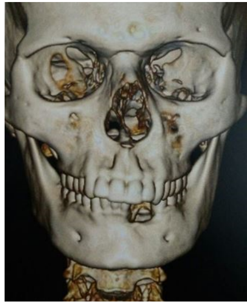
Fig. 2: 3D Reconstruction of computed tomography scan showing bone involvement

Histopathological diagnosis of ameloblastic carcinoma is difficult especially when it arises denovo and it should be differentiated from primary intraosseous squamous cell carcinoma, high grade mucoepidermoid carcinoma and other metastatic carcinomas of jaw. Therefore