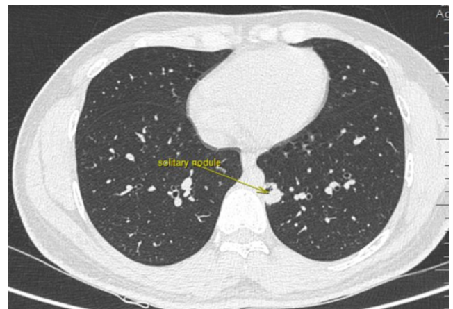
Fig. 3: HRCT chest showing cavitating solitary nodule in the lung

histopathological features of ameloblastoma like peripheral palisading, reverse polarity and stellate reticulum like structure in the background of anaplasia and frequent mitotic figures provide clues in diagnosis of this entity. 12 Treatment of choice would be curative intent surgical resection with wide margins, determined by site and extent of tumour. There are a very few reports comparing surgery, radiation and chemotherapy. A systematic review of 153 cases to identify prognostic factors has shown that surgery with or without neck dissection (140.134 months, 95%CI 106.247–174.02) is the best primary modality of treatment. Radiotherapy (17.5, 95%CI 2.948–32.052) or chemotherapy (8 months, 95%CI 8 to 8) alone was not effective. The survival analysis has shown no benefit of additional treatment such as radiotherapy or chemotherapy.