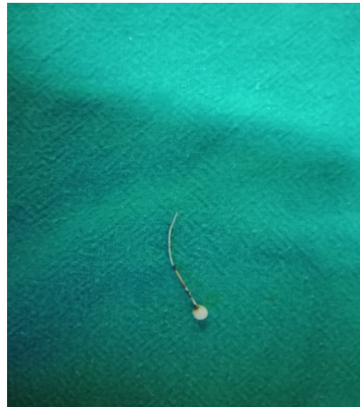
Fig. 3: Foreign body: A Turban pin after removal)