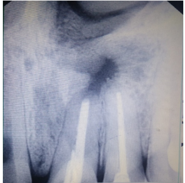
Fig. 5: Post Op radiograph T 6 month

bone formation in both groups (PRF & Non PRF) using intra oral periapical radiographs & Orthopantomographs at first, 3 rd third 6 th , 9 th & 12 th months post operatively. Highly Significant bone formation was noted in PRF group at 3 rd month & bone healing was almost complete on 6 th month. Non-PRF group (Control) showed slow radiographic bone healing. Bone healing was complete between 9-12 months.