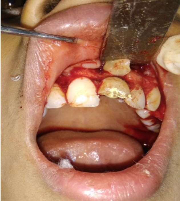
Fig. 3: PRF placement into surgical cavity