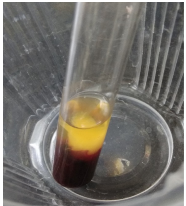
Fig. 2: PRF Gel preparation