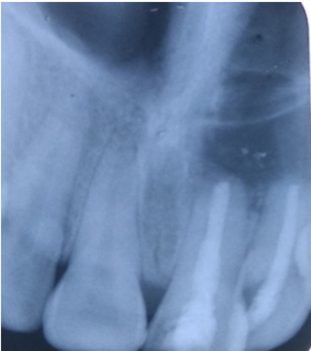
Fig. 4: Post op radiograph at 3 month