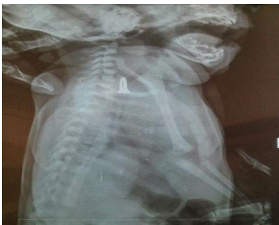
Fig. 2: X-ray Soft tissue neck lateral view