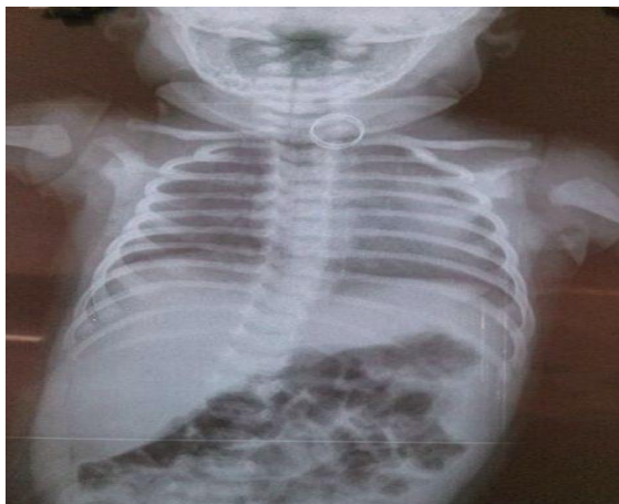
Fig. 1: X-ray Soft tissue neck Anteroposterior view