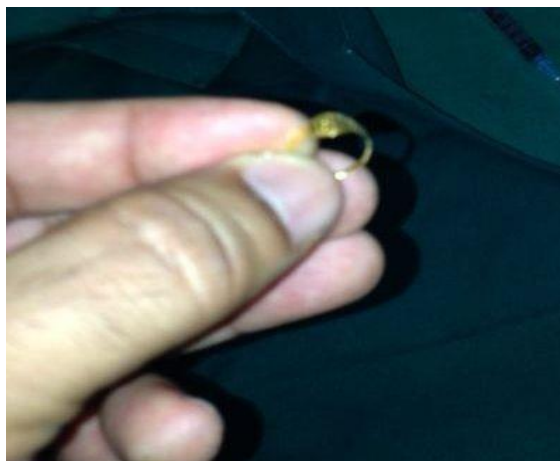
Fig. 3, 4: Foreign body(finger ring)