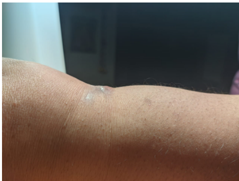
Fig. 1: Swelling over the left wrist

On surgical exploration under (Wide awake local anaesthesia no tourniquet) WALANT, APL and EPB tendons were seen and DC 1 pulley release was performed. On careful examination, two similar sized slips of EPB (Figure 2) was found with the additional medial slip (Figure 3) surrounded by thickened synovial sheath which was then incised and tendon gliding seen freely on command. The longitudinal central furrow between two slips corresponded to what seemed tendon tear on latest USG.