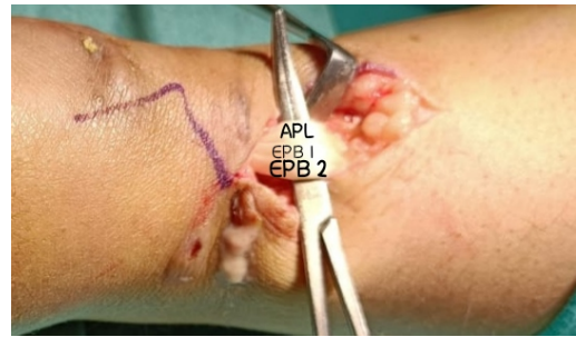
Fig. 3: Additional medial EPB slip (EPB 2)

APL tendon have been shown to have multiple slips and often encountered as the cause of dequervain's tenosynovitis. 5,6 EPB on the other hand have been seldom shown in texts to have multiple slips until study by Lyall. 7 That significant variation exists in tendon and muscle belly