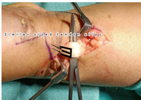
Fig. 2: Multiplicity of EPB tendon slips

Patient was advised immediate range of motion exercises and returned back to her work. On subsequent follow ups, patient remained pain free.