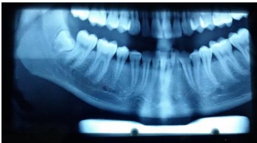
Fig. 2: No abnormality detected with OPG examination