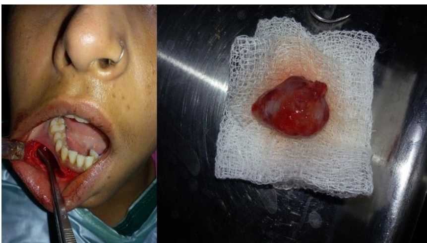
Fig. 3: Excision of the tumour was carried in to separating it from the mental nerve