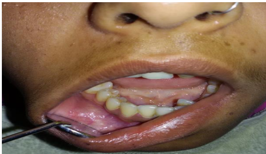
Fig. 1: Intraoral examination not associated with any discharge or change the texture of the overlying tissue