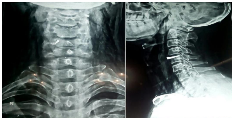
Fig. 2: X-ray (AP and lateral view) showing foreign body embedded in C5 vertebra