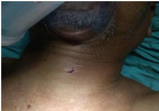
Fig. 1: Clinical picture showing entry point on left anterior part and swelling in the neck

allis forceps (Fig. 5). Prophylactic tracheostomy was done intraoperatively as patient had lot of subcutaneous emphysema in the neck. Patient did not have complications post-operatively and he was discharged after decannulation after 7 days.