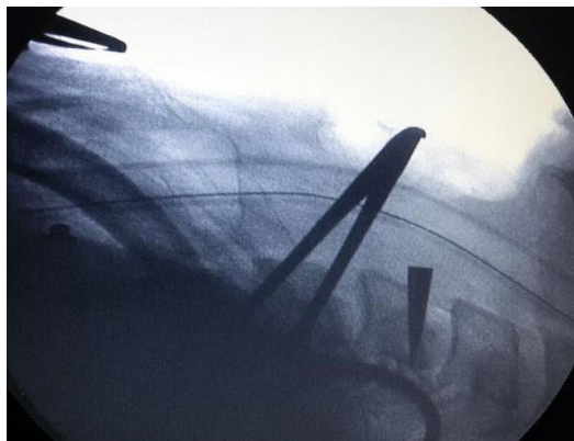
Fig. 4: C-arm picture taken intra-operatively which helped us to locate foreign body in neck