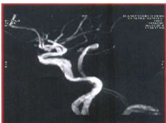
Fig 2: Basilar artery showing embolism