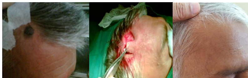
Fig. 5: Melanocytic Nevus forehead. Excision and reconstruction done with Limberg flap. Hardly visible scar