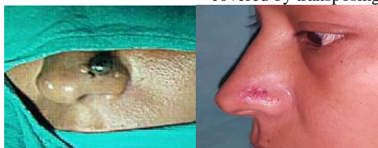
Fig. 1: Aesthetic excision of large nevus from nose and primary closure

We managed three lesions in three patients by excision and closure of defect with Limberg flap. Two of these lesions were on temporal region and one on lower eyelid around medial canthus. Before excising the nevus most suitable flap was planned and marked with surgical marking pen. Nevus was excised and flap was raised with very gentle tissue handling. Defect was covered by transposing the flap.