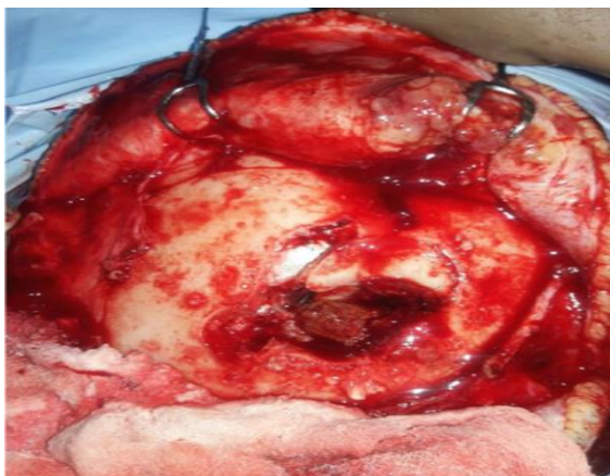
Fig. 3a: Intra Operative: Depressed Bony fractured with retriend stone