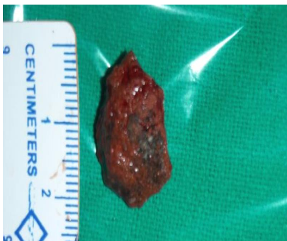
Fig. 3b: Stone (1.8×1.5×1.5 cm)