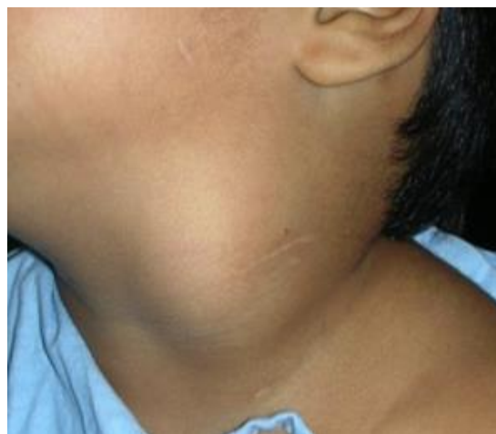
Fig. 1: Girl with Left Side Neck Mass (Cervical sympathetic chain schwannoma)

defined mass of 3.5 x 3.5 x 5.3 cm size on the left side of neck in paravertebral region. The carotid vessels were seen abutting the mass on its medial aspect with internal jugular vein on the lateral side but could not reveal a definitive diagnosis. The patient was planned for excision under general anaesthesia. Before taking up the patient for surgery, he was explained about the possibility of developing Horner's syndrome postoperatively. During surgery the mass was found abutting the common carotid artery and vagus nerve medially and internal jugular vein laterally. Hypoglossal nerve was identified superior to the mass. The tumor was found to be tapering in cervical sympathetic chain. It was 4x5 cm in size and removed in toto with its capsule intact. The specimen was sent for histopathology which showed fascicles of spindle cells having wavy nuclei in a fibrillary background and many scattered uni to multinuclear ganglion cells suggestive of schwannoma (Fig. 2). The patient developed all features of Horner's syndrome, miosis, ptosis, and anhidrosis, in the postoperative period. The patient was discharged on 5 th post-op day. On 3 year follow up patient had no recurrence.