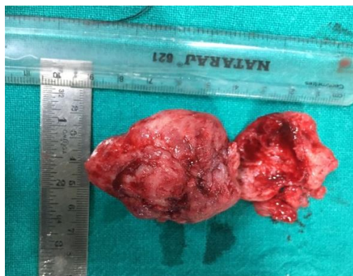
Fig. 3b: Excised mass of 9×5×4cm