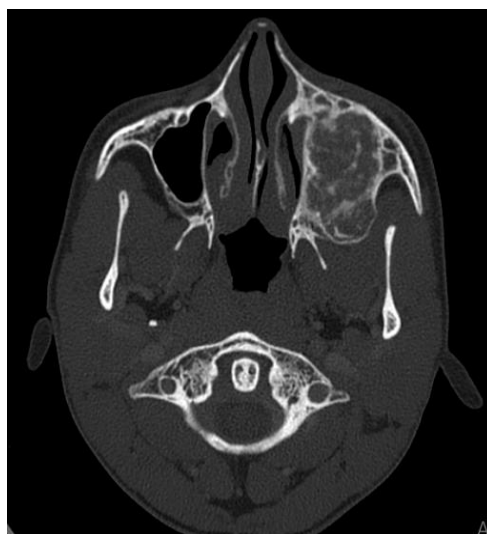
Fig. 2d: CT PNS- Axial section showing calcification in the lesion