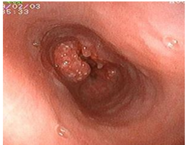
Fig. 2: Growth Oesophagus