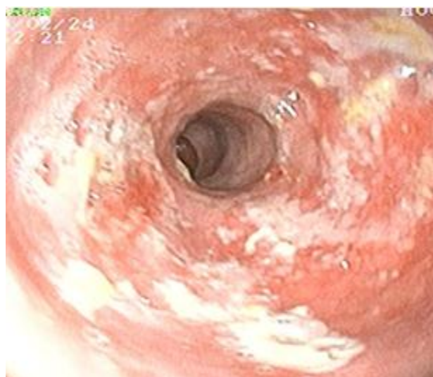
Fig. 1: Reflux Oesophagitis